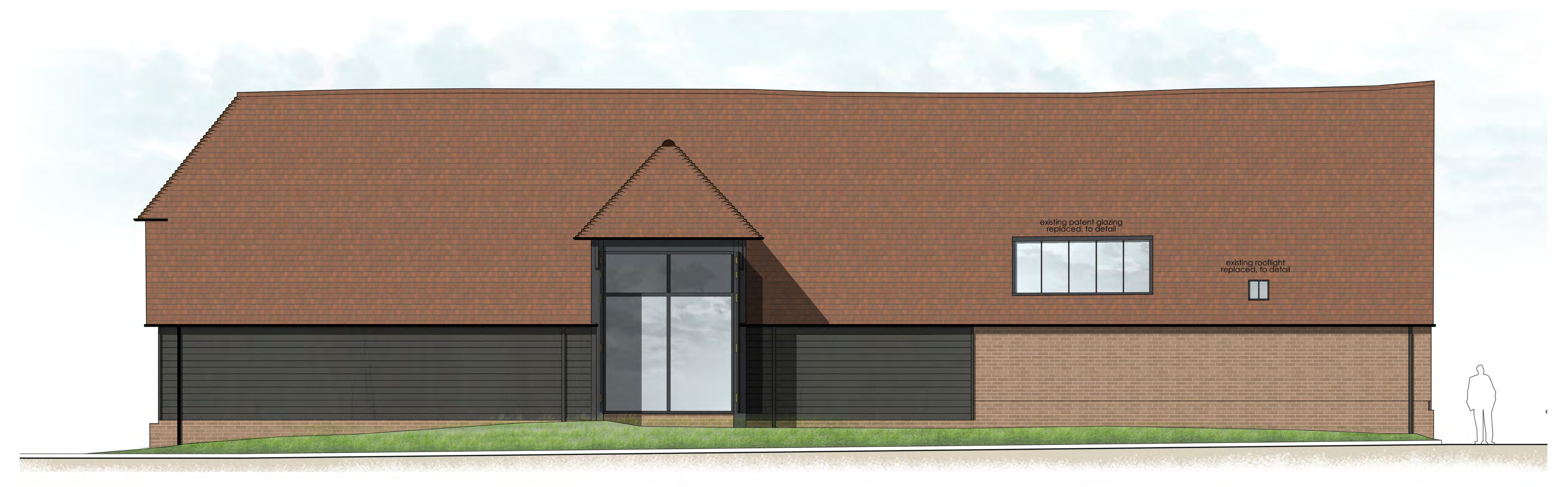
Proposed north-west elevation